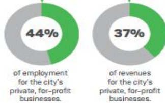
Figure 1: Small Business Breakdown by Size